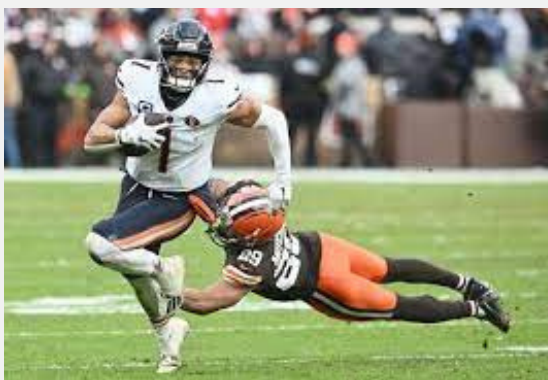
Cameron Mitchell gets Justin Fields by a foot on 4th down, starting Browns rally by Bears

Justin Fields, the bears' coaching is the problem for their losses. Here's what he thinks. "I liked the times I felt like I was in a rhythm. Things I didn't like. I felt like I was playing robotic. My goal this week is to forget everything else and just play football. That's when I play my best when I am out there playing free. I'm going to go out there and be me." He said he needs to stop overthinking and just start playing. He stated the coaches wanted to keep him in the pocket more this season after he rushed over 1000 yards last year.